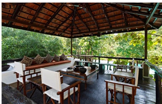
Reni Pani Jungle Lodge