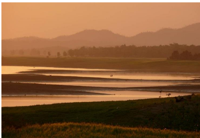
Dusk at Satpura National Park

Mammalian highlights during a visit to Satpura are likely to include Leopard, Sloth Bear, Gaur, Asian Wild Dog and Indian Giant Squirrel, while birds such as Indian Skimmer, Bar-headed Goose, Grey Junglefowl, both Red and Painted Spurfowl, hornbills, babblers and bee-eaters are among its avian specialities. As well as traditional jeep safaris in Satpura, walking safaris are permitted in designated areas of the park, and you can explore the shores and inlets of Tawa reservoir by boat or canoe. We stay in a superb wildlife eco-lodge during our visit to Satpura and for those who wish to stay longer can take an optional extension to stay the three nights at Bori Wildlife Sanctuary, which is only a couple of hours drive from Satpura National Park.