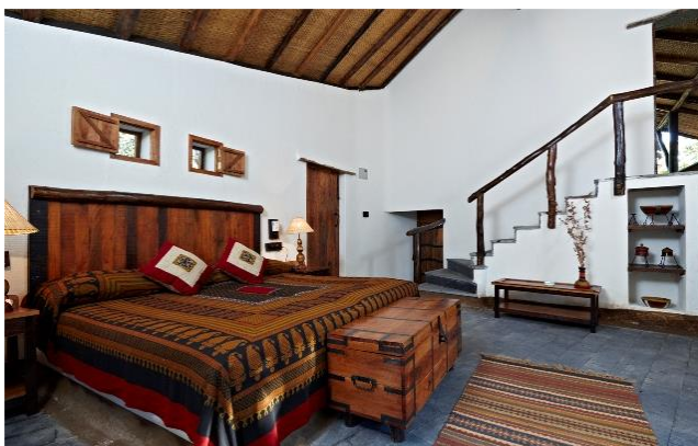
Reni Pani Jungle Lodge

The Reni Pani Jungle Lodge is an exquisitely designed conservation and wildlife focused lodge located close to the Satpura National Park and Tiger Reserve. The camp features 12 luxury cottages and 4 luxury tents encompassing 3 distinct structural designs, a cosy central meeting place called the Gol Ghar and a jungle pool located along its seasonal nullah. The lodge is spread over 30 acres of striking forest and features exactly what a nature lover would want, magnificent trees, a sprawling meadow, a seasonal nullah, uneven yet beautiful topography and water holes that attract several species of birds and animals.