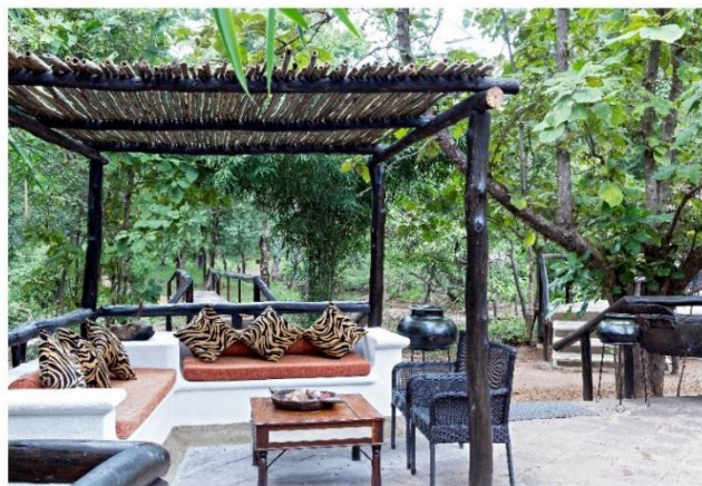
Reni Pani Jungle Lodge