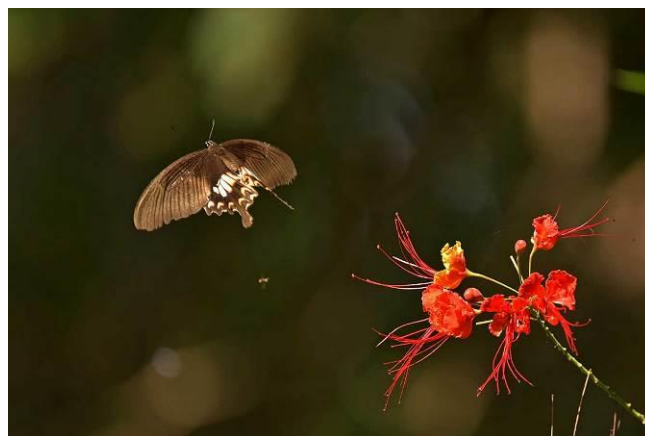
Common Rose butterfly