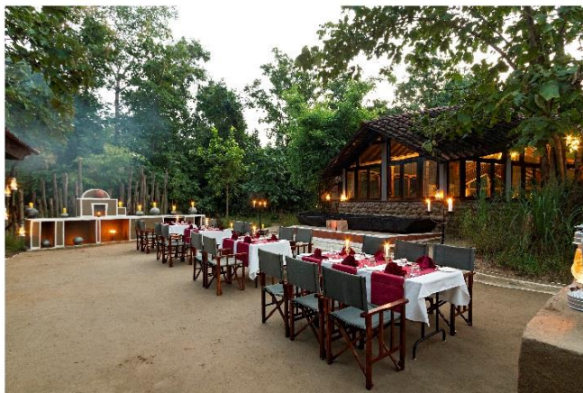
Reni Pani Jungle Lodge