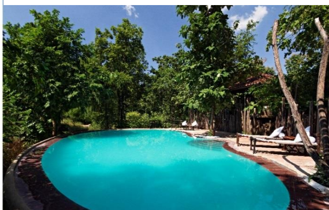
Reni Pani Jungle Lodge