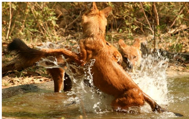
Indian Wild Dogs (Dhole)

Post an early lunch, you will leave Reni Pani Jungle Lodge to the boat jetty and take two and a half hour boat ride to the Tawa reservoir, where the transfer vehicles will meet you and then take you to the Bori Wilderness Lodge. The drive time from Tawa Reservoir to Bori Wilderness Lodge is approximately one and a half hour. In the evening you will settle into the lodge and have an early dinner