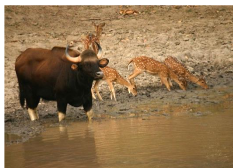
Gaur and Spotted Deer

Please provide us with your passport details (passport number, date of issue, date of expiry and your date of birth) at the time of booking. It is important to note that game safaris will be booked using the same passport details that you provide us at the time of booking, and it will not be possible to change these details once they have been booked. (If you renew your passport after booking, please also bring the old passport whose details you gave us at the time of booking as this will also be required).